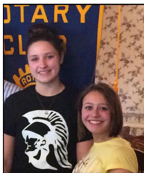
RYLA ATTENDEES 2015